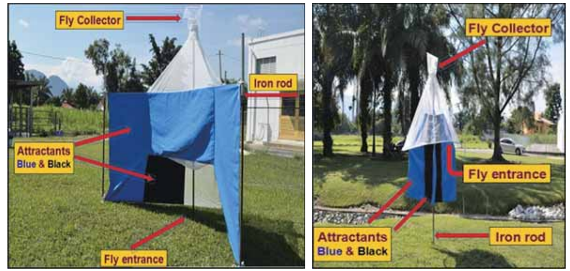
Figure 1. NZI flytrap